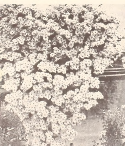
JANE HARTE NCF272 3 for $1.25 6 for $2.25